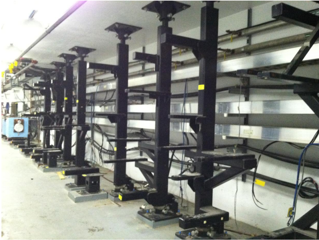
2S Ready for Stand Removal