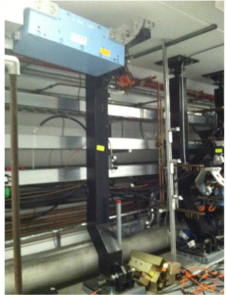
2R Disconnects → magnets removal started 6/19