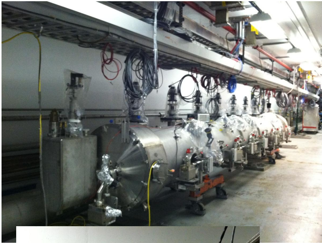
C100 -3 parked @ 1L24