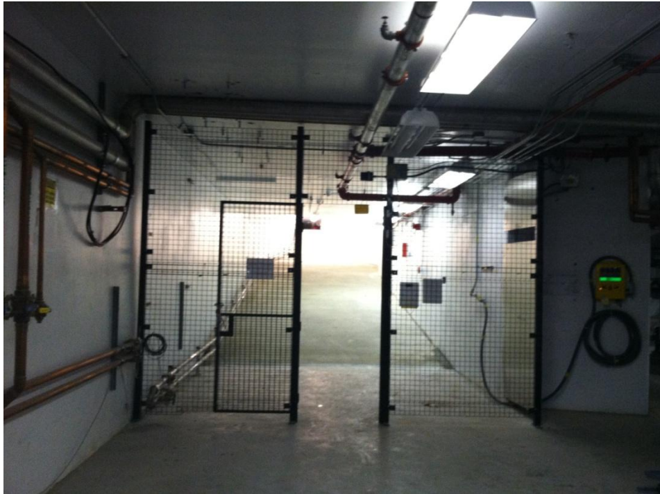
NE Stub Gate