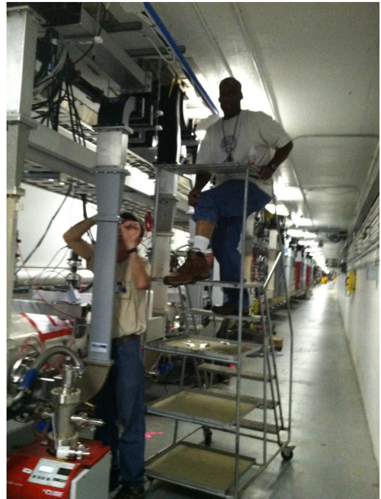
2L22 Waveguide Work